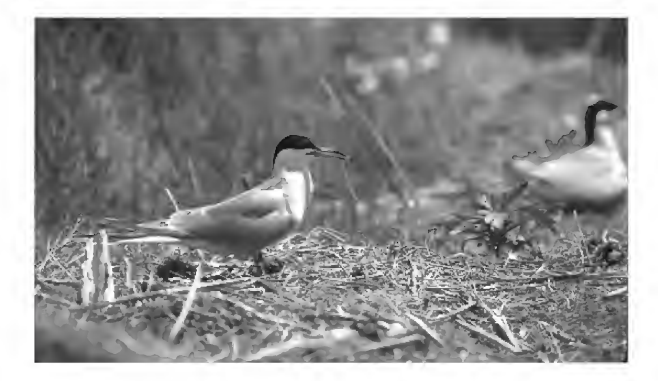
Common Tern at its nest, South Marsh Island, Somerset County.

Terns at Tanyard on June 4 and single birds there on July 25-26. At Lake Elkhorn 2 Caspians were seen on July 20 (Coskren). Three Royal Terns at Benoni Point, Talbot County on June 21 (H. Armistead) were unusual, while 28 at Morgantown on July 3 (Jett) and 34 at Deal Island WMA on July 11 (H. Armistead) were more expected. Brinker and Weske banded 490 young Royal Terns in the colony at Ocean City on July 14. Sandwich Terns were seen at Ocean City through the summer, including 2 on July 1 (Stasz, Hafner) and 4, 3 adults and 1 juvenile, on July 27 (Dyke), but none were known to have nested there. Single Sandwich Terns were seen at Point Lookout and Smith Island on July 30 (N. & F. Saunders). Craig estimated 80 Common Terns at Point Lookout on July 9. Interesting sightings of Least Terns were 2 at Greenbelt through early July (Mozurkewich) and 1 at Anacostia River Park on July 20 (Greg Gough). A Black Tern was seen over Chesapeake Bay off Smith Island on June 26 (Stasz, Miller, Jett), and Bystrak saw another over Jug Bay on June 29. A Black Skimmer was at Point Lookout on July 7 (Craig) and 1 at Chesapeake Beach on July 23 (Iliff).